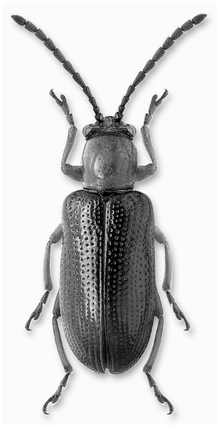
Fig. 1. Habitus photograph of Oulema melanopus .

benacadie, 31.VII, 1997, J. Ogden, (1, JOC); Shubenacadie, 1.VIII, 1997, J. Ogden, (2, NSNR). Halifax Co. : Point Pleasant Park, 15.VI. 2001. C.G. Majka,